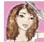
Cut and style into a slightly angled bob.

Try this out for a different take on a classic style. Take advantage of the long, loose curl pattern by styling a long and slightly angled bob. Add more layers toward the crown and in the back for extra volume.