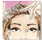
Layer the crown for added fullness.